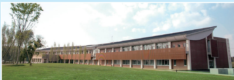
Ibaraki Kasumigaura Environmental Science Center (IKESC)