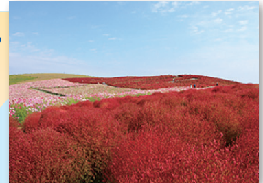
Hitachi Seaside Park